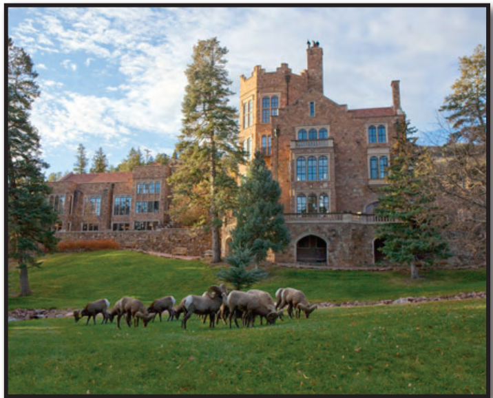
Venue for our 2012 Worship Mentor Gathering will be the Castle Glenn Eyrie in Colorado Springs.

Preparations: In November I flew out to Colorado to secure a location of our 2012 Worship Mentor Gathering . I believe I covered most of the state hunting for that perfect location where God would spend some quality time with His Worship Leaders, His Musicians and His Creative Artists who will be in attendance at our next Gathering. The environment is so important to these annual Gatherings. God does so much in the lives, hearts and minds of these men & women who faithfully