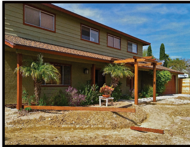
Château Cochran – Front “Yard” – A Work in Progress...

Painters coming in from all over the country. I am so happy to be meeting weekly with a number of people seeking to grow together in our life in Christ. I continue to be invited to guest worship lead a few times a month at various churches, which is so great, and I'm so honored. AND ... I'm working on our house.