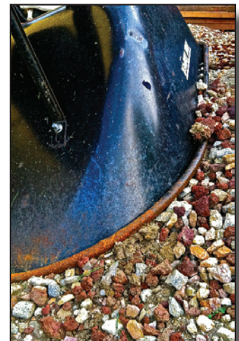
Rocks or “Landscaping” in our front yard.