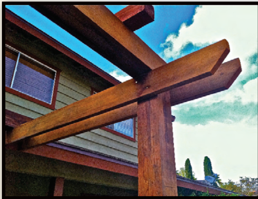
Redwood provided by Father-in-Law

pick-up trucks and even more cultures represented “going for it” in our “front yard” for the most desirable colored rocks. They seemed to like the brown lava rock best. It was the funniest thing you’ve ever seen. Not sure what exactly was being said but there were some turf wars going on for a while. By a little after 8am all that was left was a few piles of dirt mixed with the left over rock. They took it ALL!!!! That was awesome and hilarious.